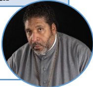
Rev. Doctor William Barber, II

• Founder, Project 562, a body of imagery and cultural representations of Native Peoples