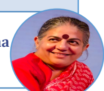
Dr. Vandana Shiva

• University of Minnesota Regents Professor of American history and Director of the Immigration History Research Center